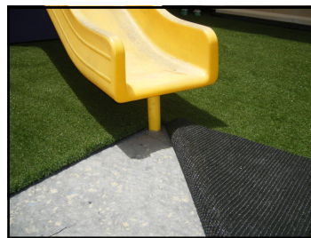
All-In-One products can be used directly under Synthetic Turf for a low-maintenance, aesthetically pleasing, and durable playground.