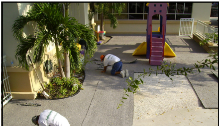
Community Church of Vero Beach Vero Beach, FL

Using All-In-One can eliminate stone drainage layers, therefore substantially reducing the need for excavation, removal, and the replacement of aggregate. In addition, it can eliminate up to 4" in the base layer, which can directly impact your bottom line. With All-In-One, you get a product that does it all with less.